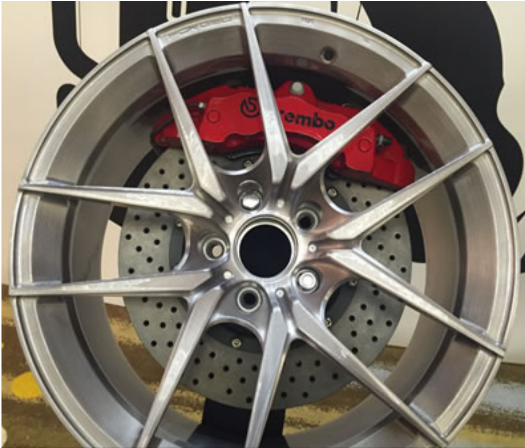
Brake System - Brembo 380MM